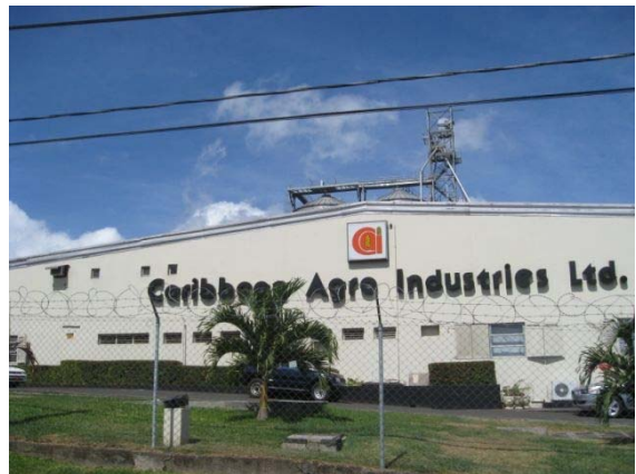
Agrochemical Factory, Mt. Gay Estate