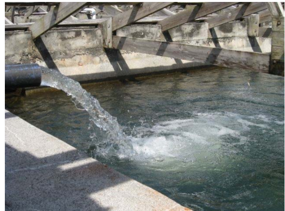
Vendomme Water Treatment Plant