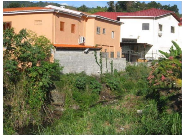
Commercial buildings and homes on river bank