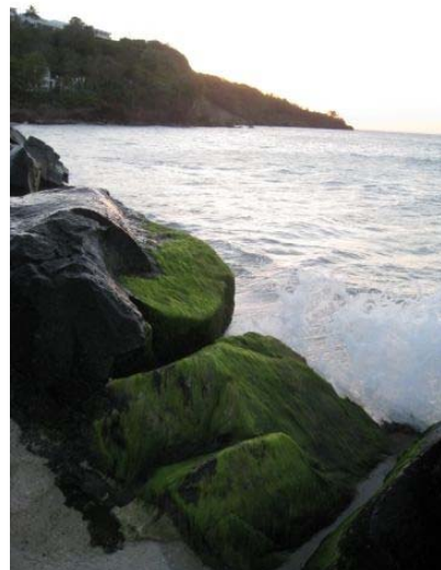
Marine algae, Grand Anse Beach