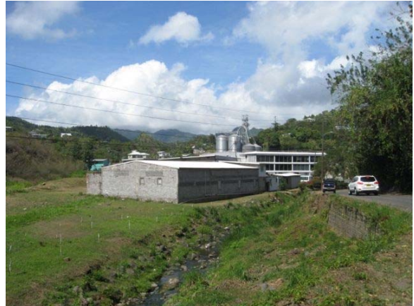
Factory beside diverted river, River Road