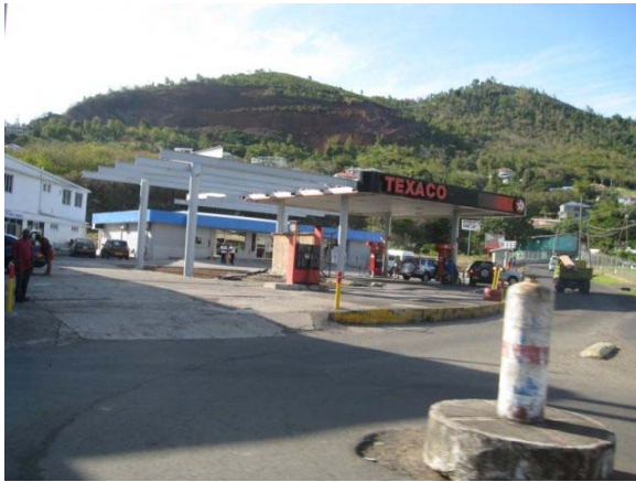
Petrol station off River road