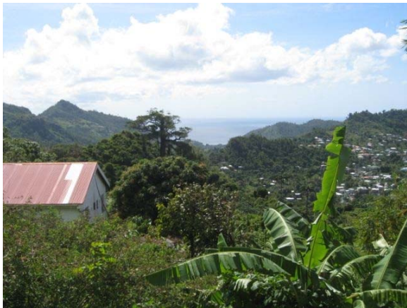
View of watershed from Beaulieu