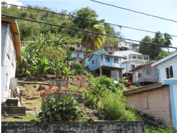
Community of D'Arbeau, off River Road