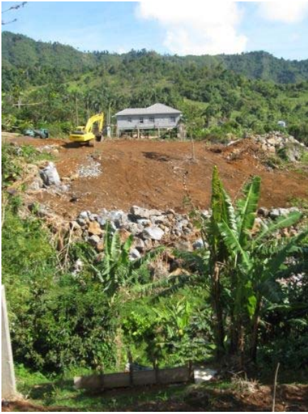
Clearing of hillside above the river; pigsty below is sited on river bank